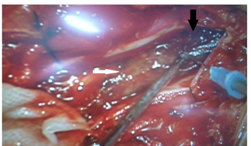
Fig 2: Intraoperative picture after opening the duramater and focally incising the arachnoid mater at the level of conus. The subarachnoid space was filled with blood (white arrow) and the conus was discoloured brownish-red due to hematoma (black arrow). A midline myelotomy revealed a dark liquefied haematoma.

Fig 1: Sagittal T1W (A) and T2W (B) MR images of dorsolumbar spine showing the bleed in conus and extending downwards. The bleed is isointense to hypointense to the cord parenchyma in T1W images and is hyperintense in T2W images. Cord oedema is seen extending upwards up to D-10 level. Axial T2 W (C) MR image of conus showing hyperintense intramedullary bleed.