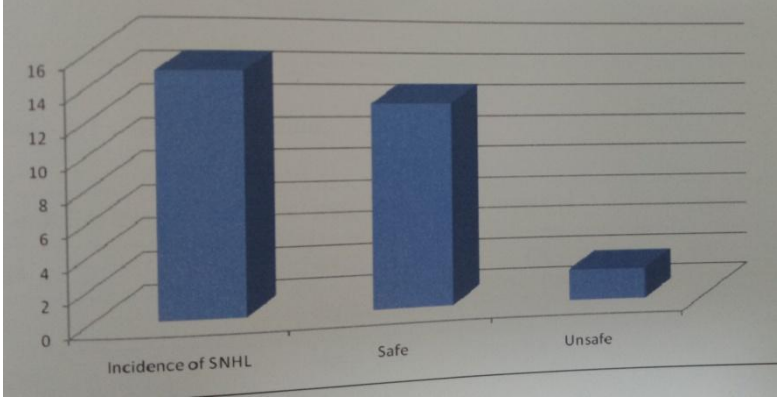
Graph 1: Incidence of hearing (sensorineural) Loss in Safeand Unsafe Type of CSOM

Chronic middle ear disease especially chronic supprative otoitis media (CSOM) is a major public health problem in developing countries. It usually leads to significant hearing loss, sensorineural hearing loss is one of them. Chronic suppurative otitis media is a stage of the ear disease in which there is chronic infection of the middle ear cleft i.e. Eustachian tube , middle ear and mastoid and in which a non-intact tympanic membrane(eg. Perforation) and discharge are present. The role of the round window membrane in the determination of sensorineural hearing loss in cases of chronic suppurative otitis media has been studied by many scientists. Round window is a semipermeable membrane, which allows some toxic materials to pass and cause biochemical changes in perilymph and endolymph causing destruction of the organ of corti.