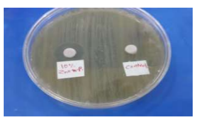
Fig. 3: Show the differences between the effect of control (dental composite resin without ZnO/NPs) and dental composite resin with addition of 10% ZnO/NPs ; (A) no inhibition growth of Klebsiella.spp (unsusceptible) to control , (B) inhibition growth of Klebsiella.spp (susceptible) to synthesis ZnO/NPs dental composite.

Fig. 2: Show no effect of the control (dental composite without the addition of ZnO/NPs) on the bacterial growth.