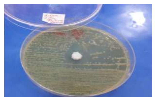
Fig. 4: Show the susceptibility (inhibition growth) of Staphylococcus aureus to the synthesis ZnO/NPs dental composite in 7% concentration prepard from this inorganic agent.

Fig. 3: Show the differences between the effect of control (dental composite resin without ZnO/NPs) and dental composite resin with addition of 10% ZnO/NPs ; (A) no inhibition growth of Klebsiella.spp (unsusceptible) to control , (B) inhibition growth of Klebsiella.spp (susceptible) to synthesis ZnO/NPs dental composite.