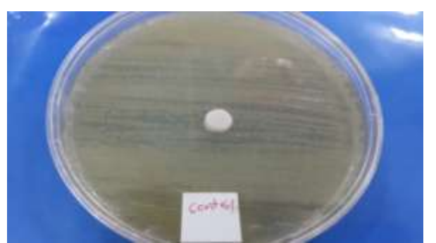
Fig. 2: Show no effect of the control (dental composite without the addition of ZnO/NPs) on the bacterial growth.

Fig. 1 : Show the susceptibility (inhibition growth) of Streptococcus mutans to the synthesis ZnO/NPs dental composite in three concentrations 5%, 7% and 10% prepard from this inorganic agent.