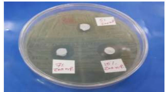
Fig. 5: Show the susceptibility (inhibition growth) of Pseudomonas areuginosa to the synthesis ZnO/NPs dental composite in three concentrations 5%, 7% and 10% prepard from this inorganic agent.