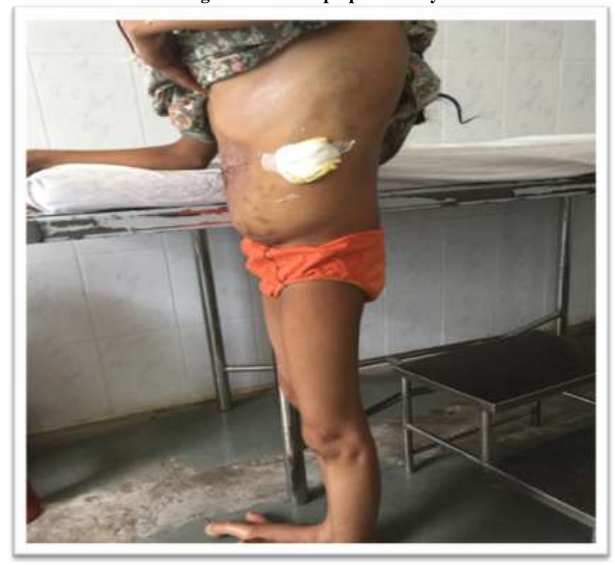
Figure 4 – Post Op Splenectomy