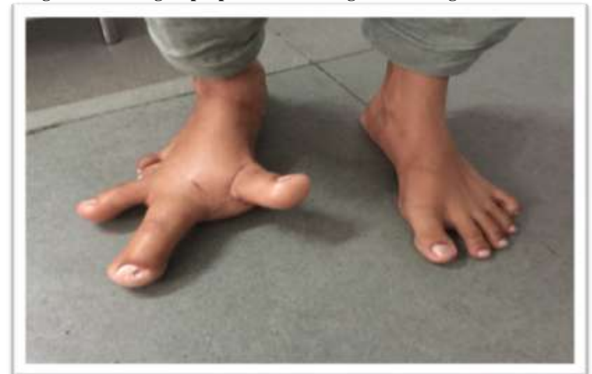
Figure-1 showing disproportionate enlargement of Right lower Limb

CT scan showed a massive splenomegaly There were multiple nevi distributed predominantly over the abdomen.