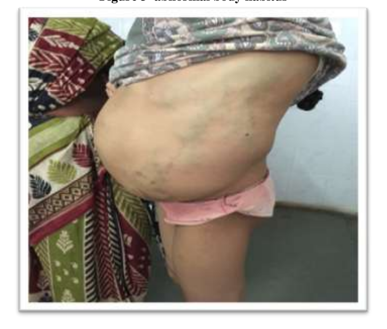
Figure 3 abnormal body habitus

The patient underwent Splenectomy and Post operative period is uneventful. Patient underwent Splenectomy & Post operative period is uneventful.