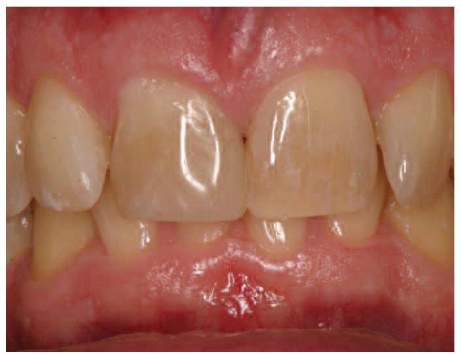
Figure 6. Final close up of finished restoration

DOI: 10.9790/0853-15126166 www.iosrjournals.org 66 | Page