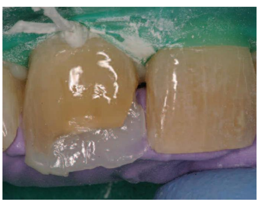
Figure 3. Occlusal white composite placed in matrix.