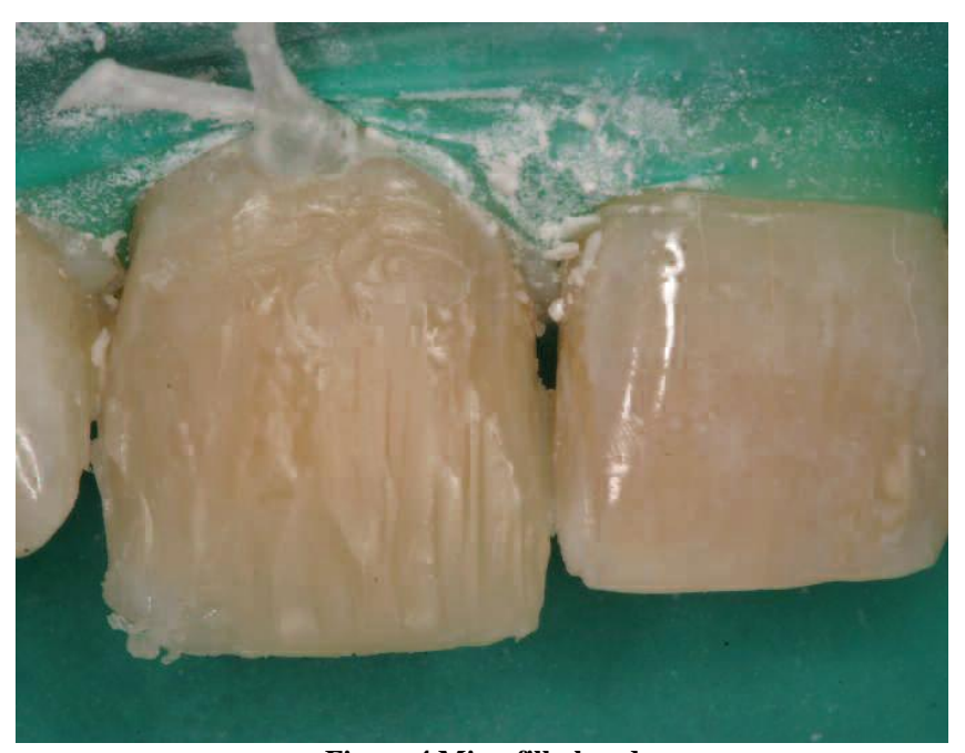
Figure 4.Microfill placed

DOI: 10.9790/0853-15126166 www.iosrjournals.org 65 | Page