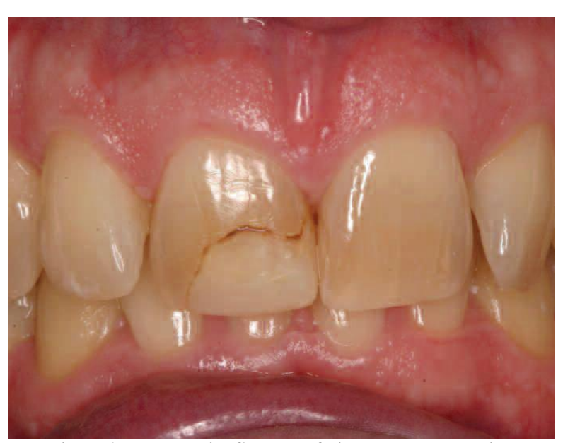
Figure 1. Pre-op smile, Close up of discoloured restoration