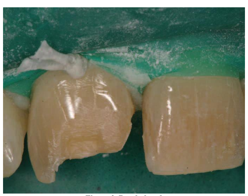
Figure 2. Bevel placed

DOI: 10.9790/0853-15126166 64 | Page www.iosrjournals.org