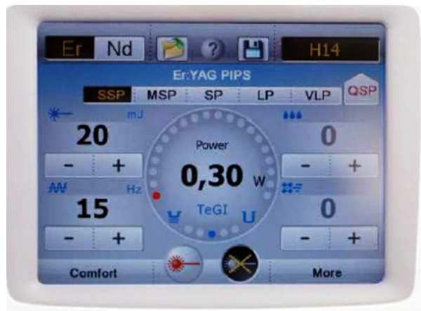
Fig.3-: Touch screen panel showing the PIPS setting, at 20 mJ, 15 Hz, no air / no water, 50 microsecond pulse duration.