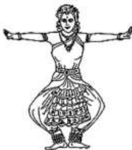
Fig : 4