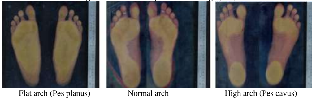
Flat arch (Pes planus)