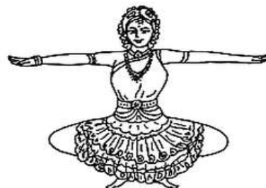
Fig : 5