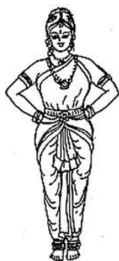
Fig : 3

The basic and major dancing postures in bharathanatyam dance are