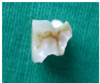
Fig1. 3: Occlusal and inner surface of fabricated inlay