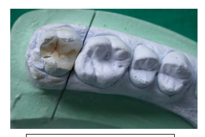
Fig1. 4: Inlay on the cast