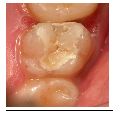
Fig1. 5: Final cementation of the inlay.