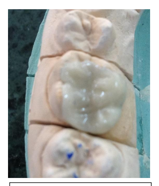
Fig2. 3: Inlay fabricated