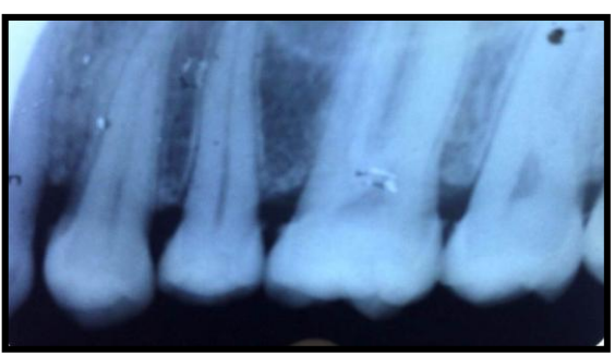
Fig: 3 Intraoral periapical radiograph showing no evidence of bone loss wrt concerned teeth