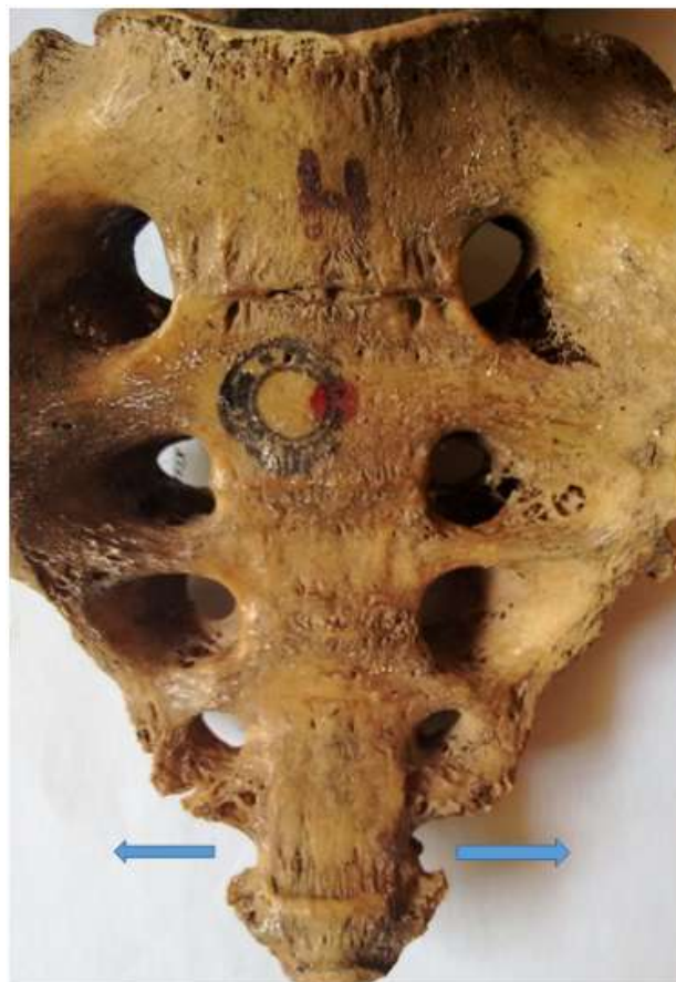
Fig 2(a) Photograph of ventral surface of sacrum showing a fifth pair of sacral foramina due to sacralisation of coccygeal vertebra. The fifth pair of sacral foramina are incomplete.