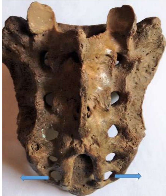
Fig 1(b) Photograph of dorsal surface of sacrum showing a fifth pair of sacral foramina due to sacralisation of lumbar vertebra.