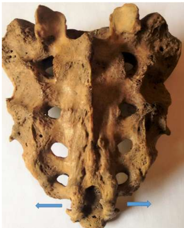
Fig 2(b) Photograph of dorsal surface of sacrum showing a fifth pair of sacral foramina due to sacralisation of coccygeal vertebra. The fifth pair of sacral foramina are incomplete.