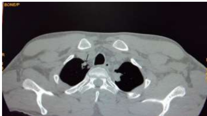
Figure 2 : CT chest shows two nodular parenchymal opacities abutting pleura in right lung apical region (arrow).