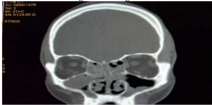
Figure 1 : CT PNS shows bilateral nasal cavity and paranasal sinus opacification with nasal septal perforation (arrow).