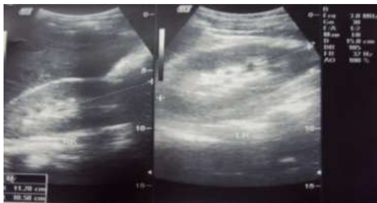
Figure 4 : USG image shows bilateral raised renal parenchymal echogenicity with normal renal size.