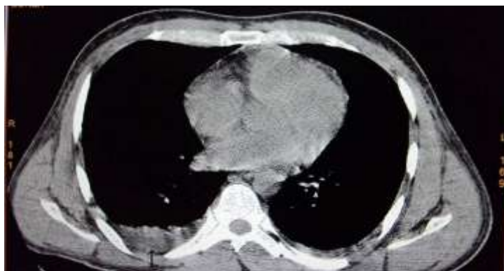
Figure 3 : CT chest shows mild pleural effusion in right lower chest posteriorly (arrow).