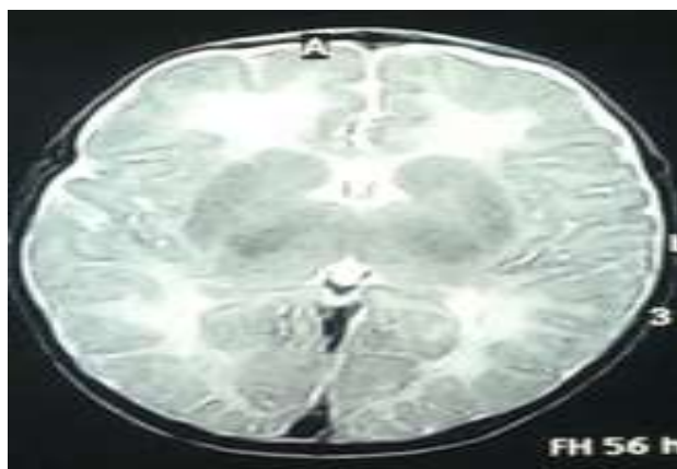
Fig. – (5)

Fig. – (4) T1 weighted MRI image shows multiseptate cystic lesions in periventricular and deep white matter of bilateral temporal, parietal and occipital lobes appears hypointense with thinning of the cortical gyri and crowding of sulci with loss of volume of white matter and ex – vacuo dilatation of lateral ventricle, suggestive of cystic leukomalacia.