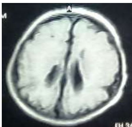
Fig. – (6)

Fig. – (5) T2 weighed MRI image shows symmetrical abnormal signals in the periventricular white matter of frontal & parietal lobes appears hyperintense, suggestive of periventricular leukomalacia .