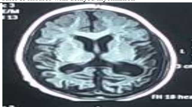
Fig. – (4)

Fig. – (3) T2 weighted MRI image shows diffuse cerebral atrophy in the form of dilatation of ventricular system and prominence of cortical sulci & fissures with delayed myelination