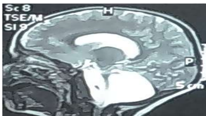
Fig. – (8)

Fig. – (6) T1 weighted MRI image shows paucity of cortical sulci with poor gray white matter interface and smooth appearing of brain parenchyma, likely representing agyria – pachygyria complex. Fig. – (7) T2 weighted MRI image shows thinning of body and splenium of corpus callosum with dilated occipital horn of lateral ventricle. MRI finding of fig. (6) & (7) are suggestive of agyria – pachygyria complex with partial agenesis / hypoplastic corpus callosum.