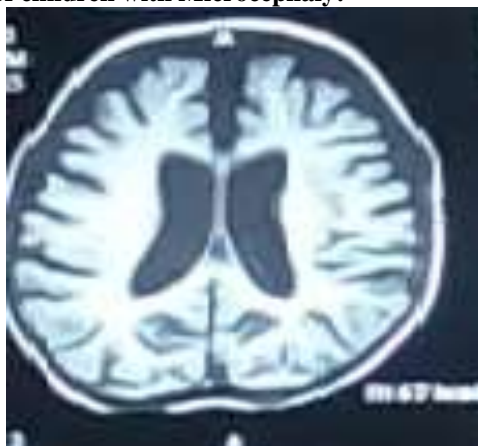
Fig. – (2)

Fig. – (1) & (2) T1 weighted MRI images shows diffuse cerebral atrophy in the form of dilatation of ventricular system and prominence of cortical sulci & fissures with loss of volume of white matter.