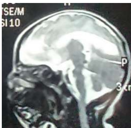
Fig. – (7)

Fig. – (6) T1 weighted MRI image shows paucity of cortical sulci with poor gray white matter interface and smooth appearing of brain parenchyma, likely representing agyria – pachygyria complex. Fig. – (7) T2 weighted MRI image shows thinning of body and splenium of corpus callosum with dilated occipital horn of lateral ventricle. MRI finding of fig. (6) & (7) are suggestive of agyria – pachygyria complex with partial agenesis / hypoplastic corpus callosum.