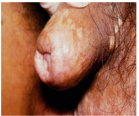
Fig :1. White patch with Phimosis

Local examination revealed atrophic white macules of 2-5mm in diameter involving the skin of prepuce near its opening. Prepuce could not be retracted.LSA lesions were not present on the other parts of the body.