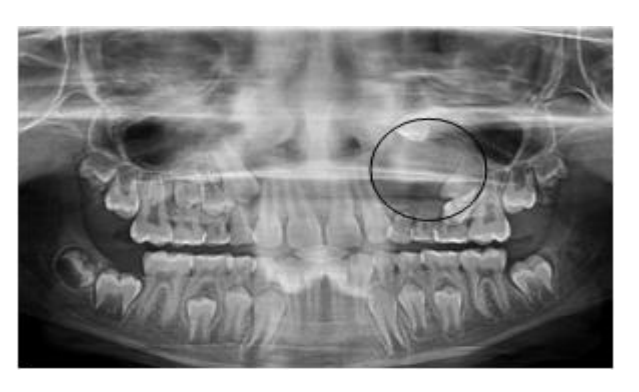
Fig. 3. Pre-operative orthopantomograph showing radiolucency in left maxillary region