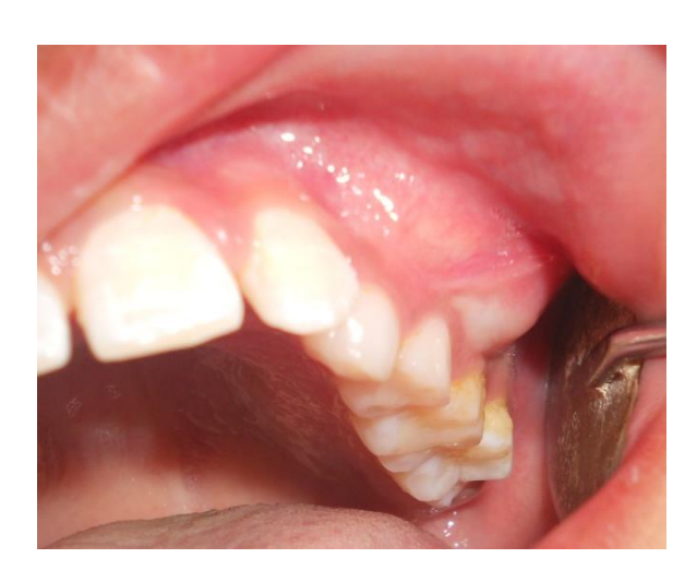
Fig. 2. Pre-operative intraoral view