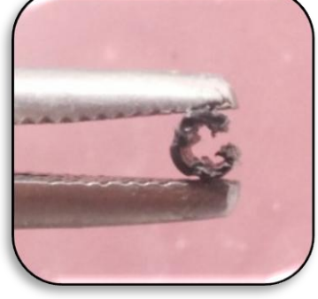
Fig. 5: Custom made attachment from sleeve of Dowel pin