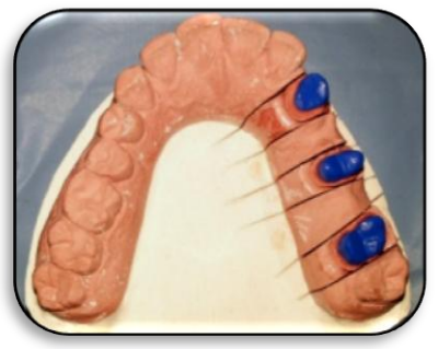
Fig. 4: Master cast