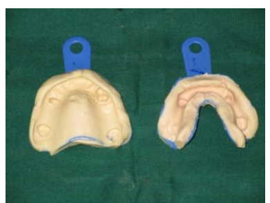
Fig 2: Preliminary Diagnostic Impression

1) Preliminary diagnostic impression was made with irreversible hydrocolloid (Alginate-Dentsply). And study cast was poured in type III dental stone. After then root canal treatment was done in 14,13,24,35,45.