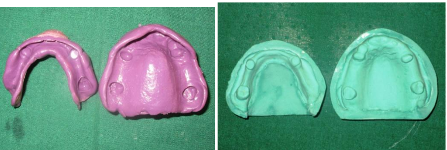
Fig 7: Final Impression made with Monophase Elastomeric impression material.

4) After cementation of metal copings to the prepared abutment tooth final impression was made with Monophase elastomeric impression material. Plaster beading and boxing was done in type II model plaster and impression was poured in type III dental stone.