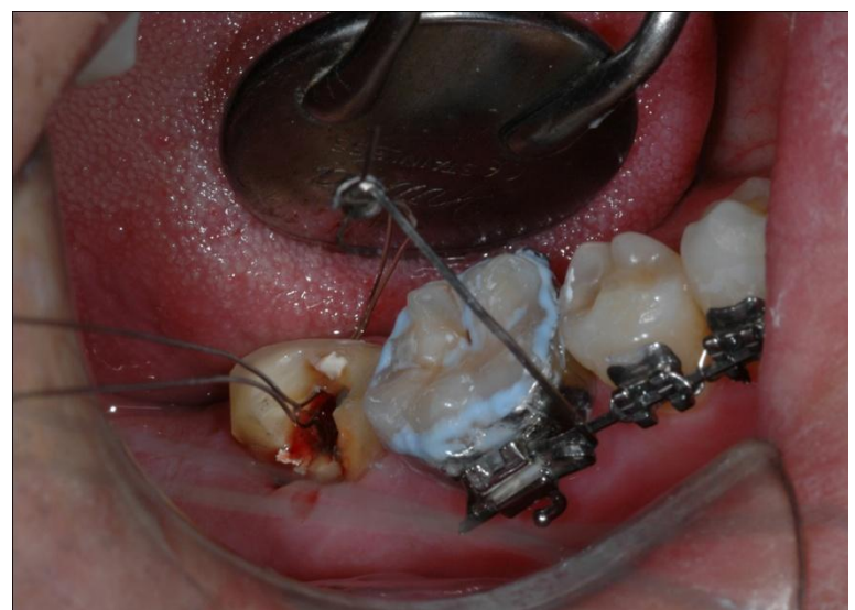
Fig.5; Photograph of #47 showing simple appliance for rapid orthodontic extrusion