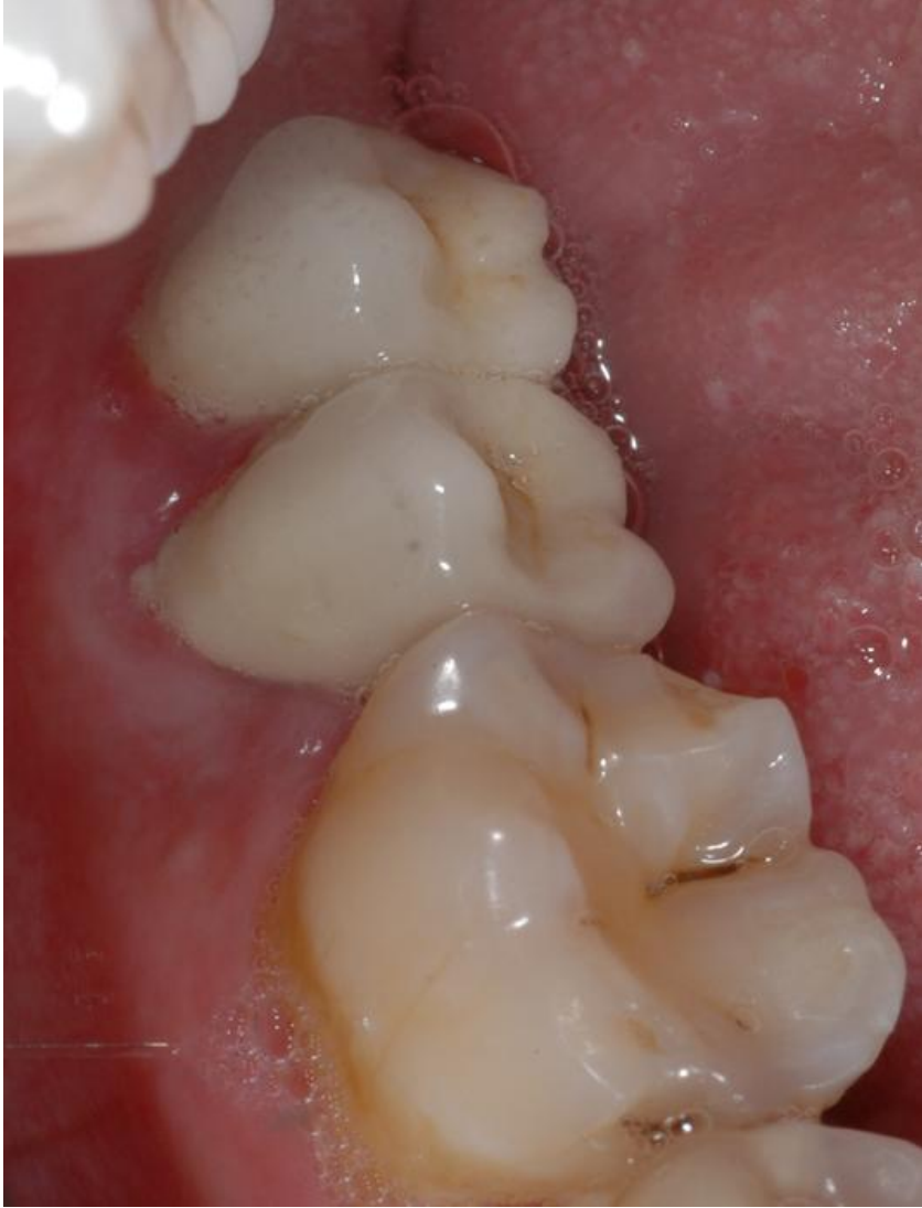
Fig.1 5; Photograph showing the two separate crown restored with metal ceramic crown ,after 12 months