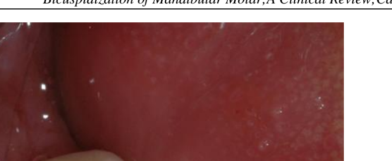
Fig.10; Prob of two separate crown