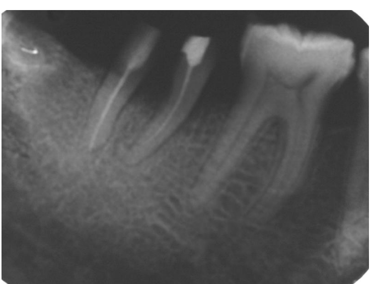
Fig.11. IOPA showing obturation of two root canals