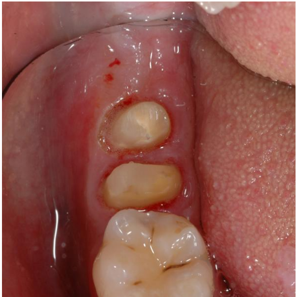
Fig.9; Post operative view