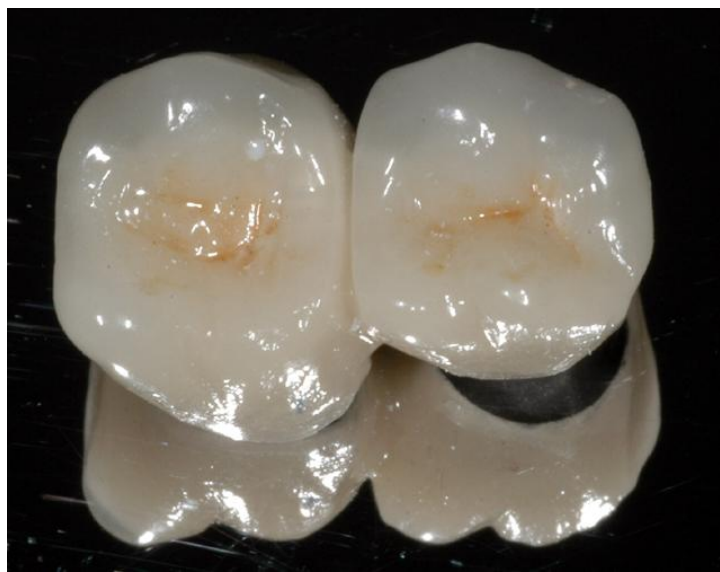
Fig.1 3; metal ceramic crown