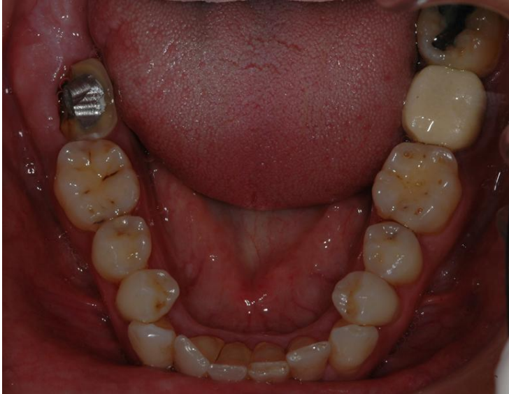
Fig.1; Intra-Oral Photograph Before bicuspidization of 47