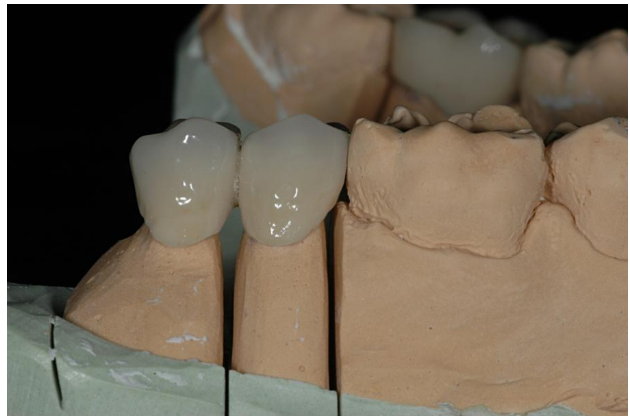
Fig.12; metal ceramic crown