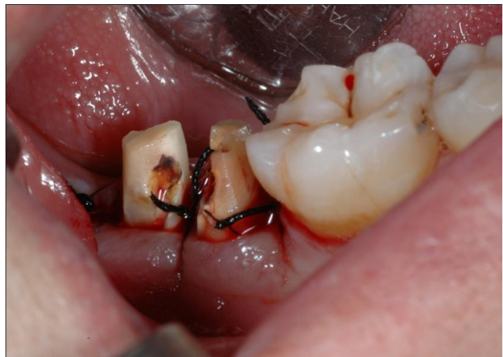
Fig.8; Photograph showing division of molar into two separatedCrowns