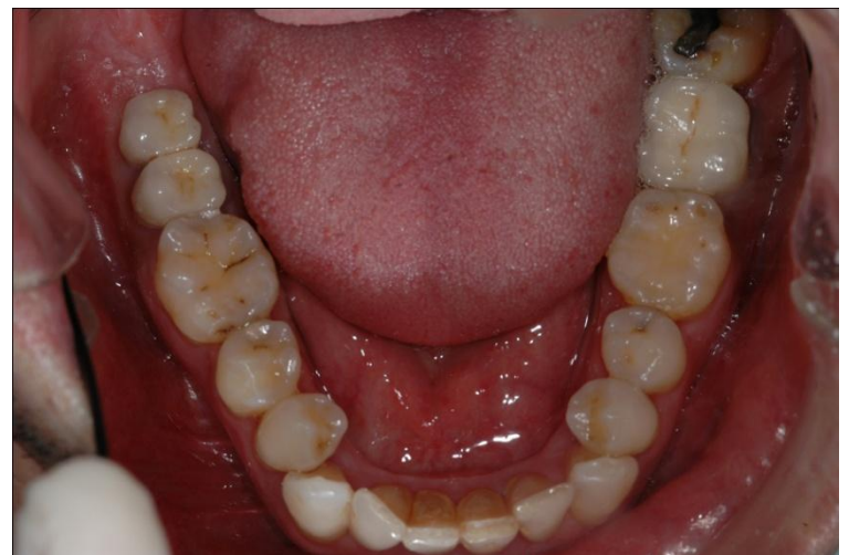
Fig.1 4; Photograph showing the two separate crown restored with metal ceramic crown