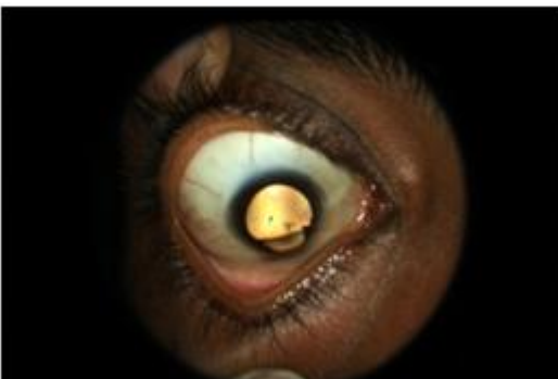
Right eye [pic. No.1]