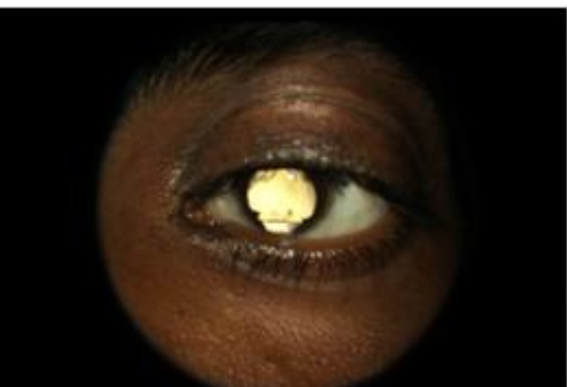
Left eye [pic. No.2]

A Case Report of Bilateral iris, lens and chorioretinal Coloboma