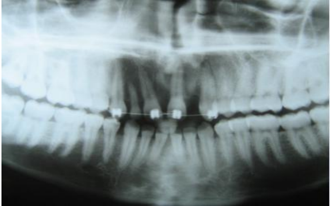
Figs. 2c-Panoramic Orthodontic treatment