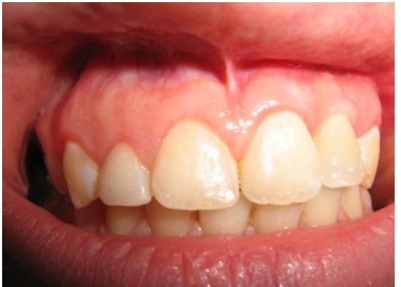
Figs. 5a- Final Restoration