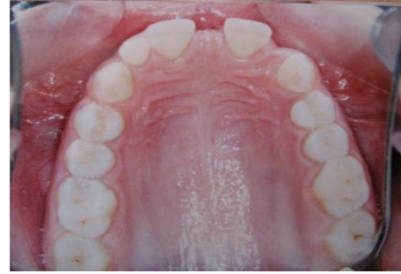
Figs. 1b -Occlusal view of the patient