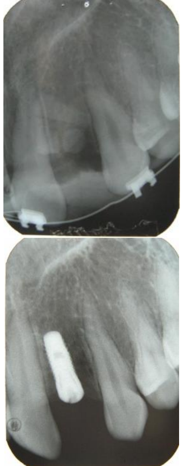
Figs. 4a- PA radiography immediately after graft placement