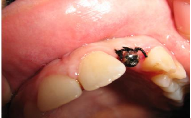
Figs. 4b- Gingival Former placement in second stage surgery