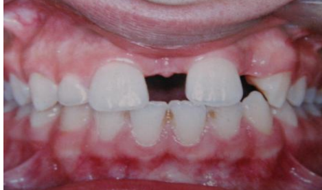
Figs. 1a- Intraoral view of the patient