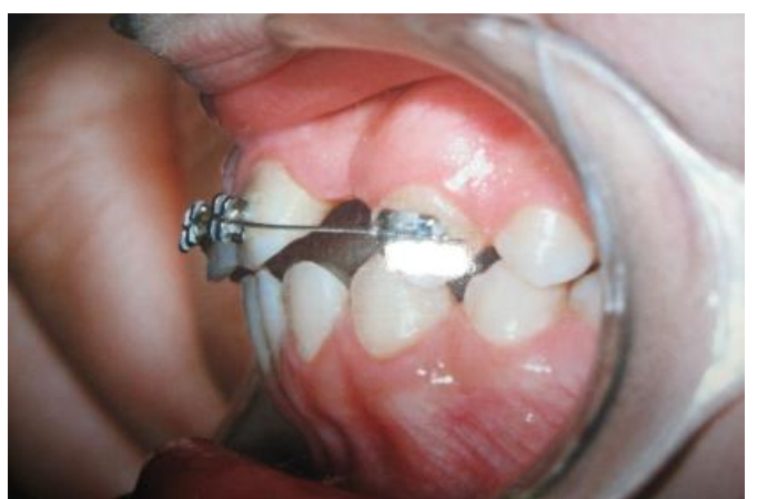
Figs. 2b- Orthodontic treatment