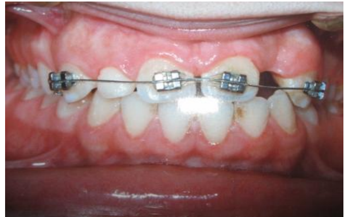
Figs. 2a -Orthodontic treatment for space management