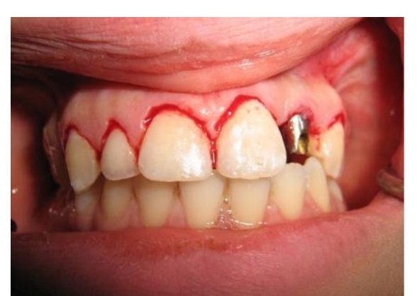
Figs. 4d-Aesthetic surgery for leveling of gingival margins.