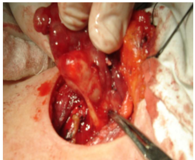
Fig. 3 Ectopic parathyroid adenoma

These cases are discovered during surgical treatment for primary hyperparathyroidism, the same period. In a group study of 8 patients, two ectopic inferior parathyroid glands are found. One patient resulted with an inferior parathyroid gland carcinoma localized in the mediastinum. The other patient resulted with an inferior parathyroid adenoma localized in the thyrothymic ligament (Fig. 3).