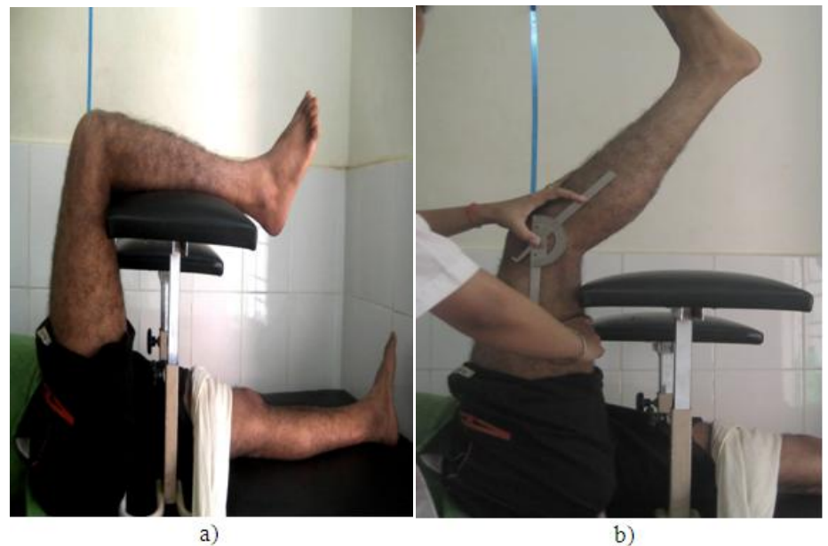
Figure 1. The AKE measurement

Pre-test measurement for AKE angle loss was taken in following manner (figure 1). The patient performed a total of 6 AKEs with a 1-minute rest period in between. The active knee extension (AKE) test was measured with hip flexed to 90^{\circ} , using half-circle goniometer. The first 5 AKEs were considered as warm-upsto decrease any effect that may occur withrepeated measures performed from a cold start<sup>7</sup>, 6th AKE was taken asbaseline measurement. There was a 60-sec rest period between reps. The stationary arm of the goniometer was placedalong the lateral femur, and the moving arm was aligned withthe lateral fibula. Subjects extended the knee to the limit ofmotion. The number of degrees from full extension wasrecorded. The post-stretch measurement was taken after 4 weeks of treatment.<sup>27</sup>