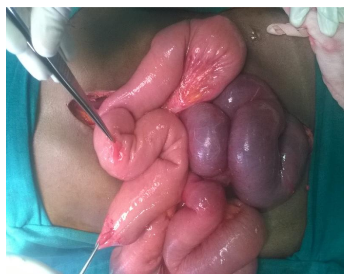
Photo plate 5) Multiple polyps initiating lead points for intussusceptions