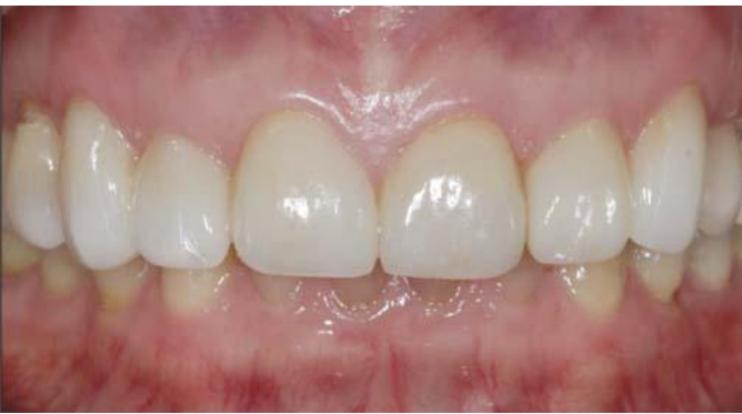
Fig 8; Frontal view of definitive porcelain laminate veneers

After 2 weeks, the final restorations was completed and tried in the mouth, all margins, contacts were verified. The final restorations were bonded using resin cement . After delivery, as shown in , the gingiva was healthy and showed harmonious shapes and contours. The proper esthetics was obtained that the shade of surrounding tissues was stable and shown balanced properties, the proportion of tooth size was favorable and satisfied .