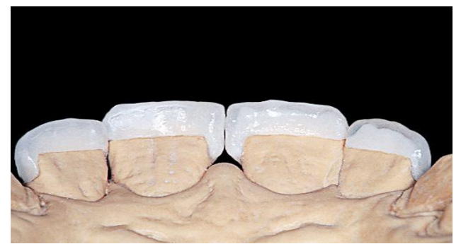
Fig 7. Veneer restorations for maxillary lateral and central incisors on master model. The palatal aspect demonstrates wrapped preparation design.

On the next visit, porcelain laminate preparation was performed with the silicone index attained from the diagnostic wax-up cast. Immediate dentin sealing was carried out for achieving improved bond strength, fewer gap formations, decreasing bacterial leakage, and reducing dentin sensitivity. The final impression was taken with polyvinyl siloxane impression material using 1-step technique. Shade was carefully decided considering the prepared teeth and opposite mandibular incisors with shade guide . The provisional restorations were fabricated directly with premade silicone index attained from the diagnostic wax-up cast . [Fig.6] [Fig.7]