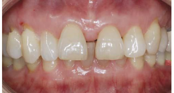
Fig.4. Pretreatment intra-oral photograph.

Deciding as for the treatment option, the MBT brackets were bonded to the anterior maxillary teeth according to their related positions, and the brackets of the right central incisor and the left lateral incisor were bonded in slightly cervical positions for extrusion [Fig.4]. Then open coil spring was inserted between the right central incisor in mesial direction. On the other hand, closed coil springs were inserted between the right central incisor and the left central incisor and between the right lateral incisor and the right canine, with keeping in mind not to overclose of the diastema and not to take the wrong distal direction for the right lateral incisor. [Fig.5] .