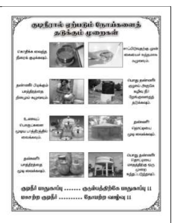
Pamphlets are in local language (Tamil) about water quality and water borne diseases and how to stop it.