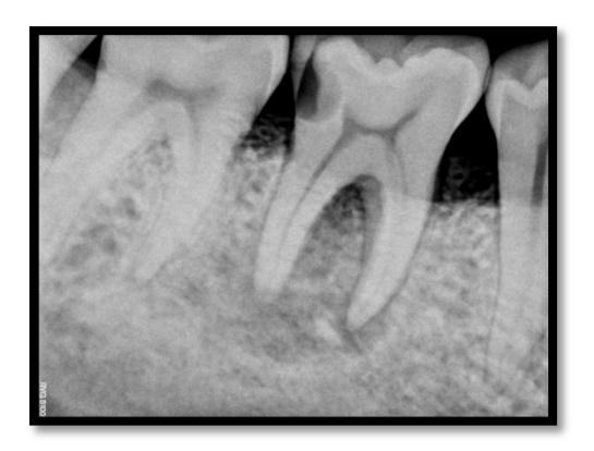
Figure 4. Radiograph confirmed radiolucency in furcation & periapical region .