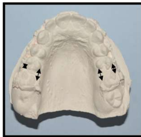
Fig.12 Post surgery analysis with cast after 4months cephalometric tracing after 4 months