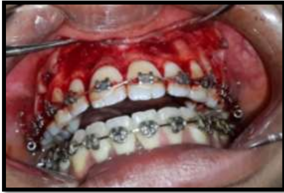
Fig.5- Full thickness mucoperiosteal flap elevated