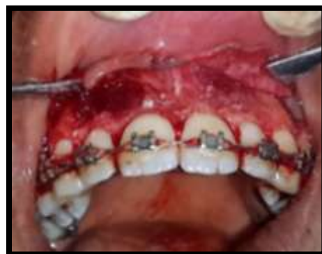
Fig.8-Graft material placed