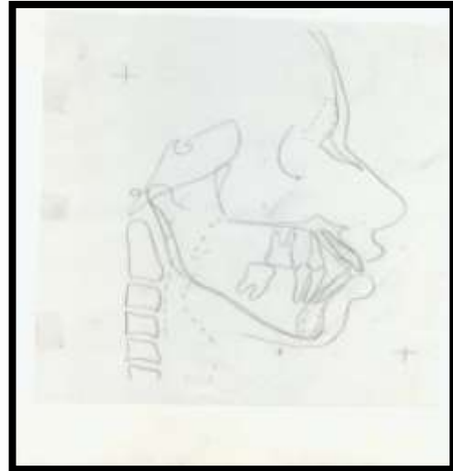
Fig.2 Pre surgery cephalometric analysis