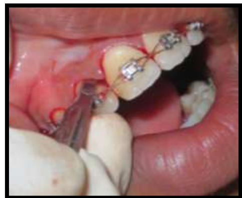
Fig.4 – crevicular incision given