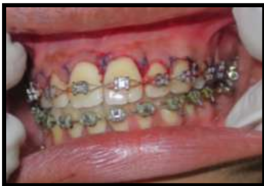
Fig.9- Suturing done