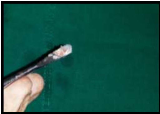
Fig.7 -Graft material