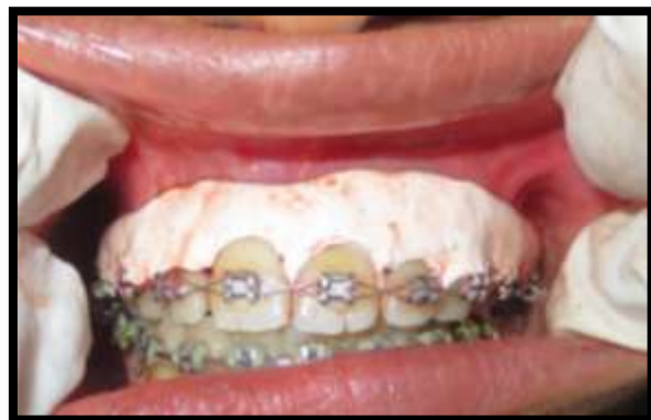
Fig.10- Placement of coe pack

In step three One week after surgery orthodontic treatment began.