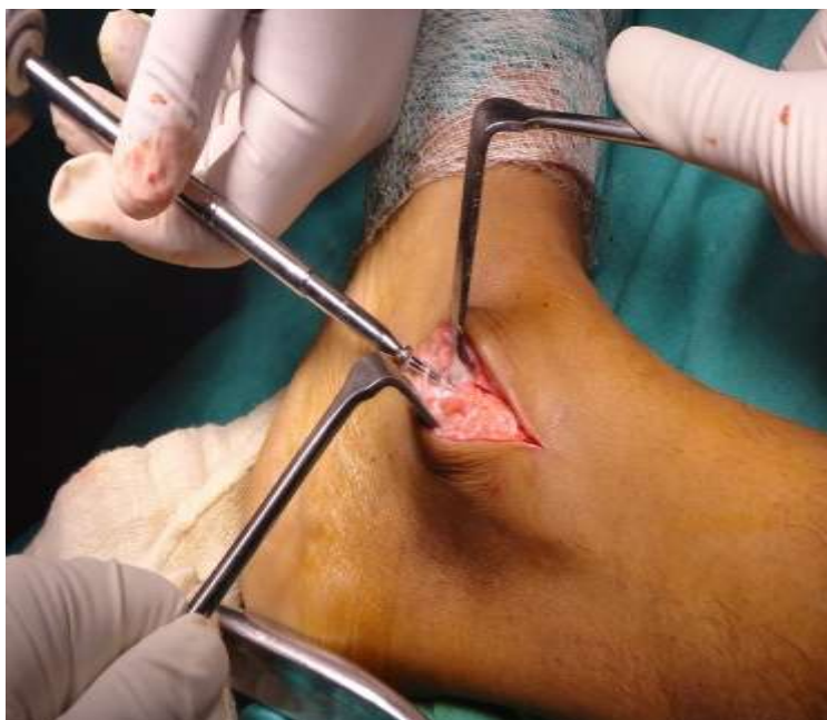
Figure 1; Showing cannulated screw fixation

In group 1 patients a 3.2-mm hole was drilled while distal fragment was held reduced with a pointed clamp or with two Kirschner wires bent to stay out of way as temporary fixation devices. Length of hole was measured, and a malleolar screw was inserted without tapping. Kirschner wires were removed after screw is tightened.