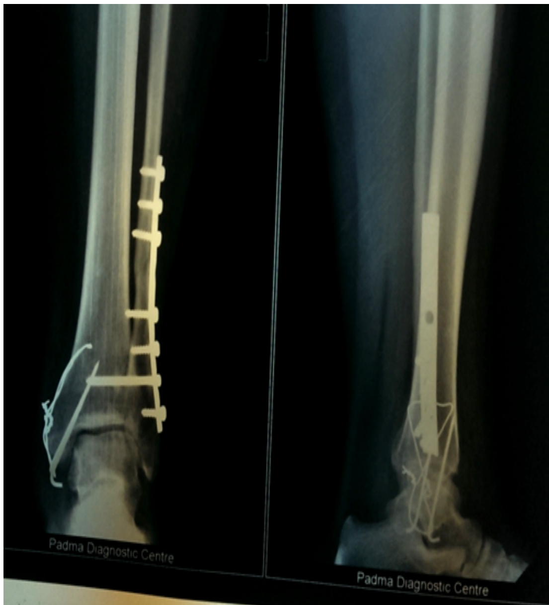
Figure3; Showing postop x-ray[group 2]