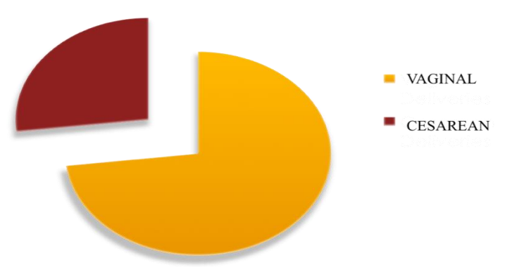
Figure – 1 – 26.9% had caesarean deliveries