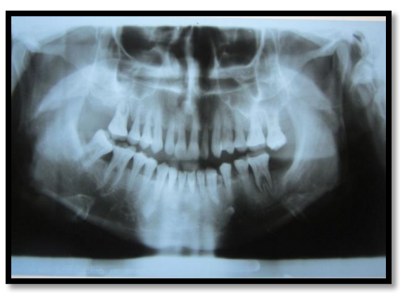
Fig: 2 Ortho Pantomogram Radiopaque shows lesions with radiolucent foci seen in the interdental regions of 33, 34, and 35 suggestive of calcifications.