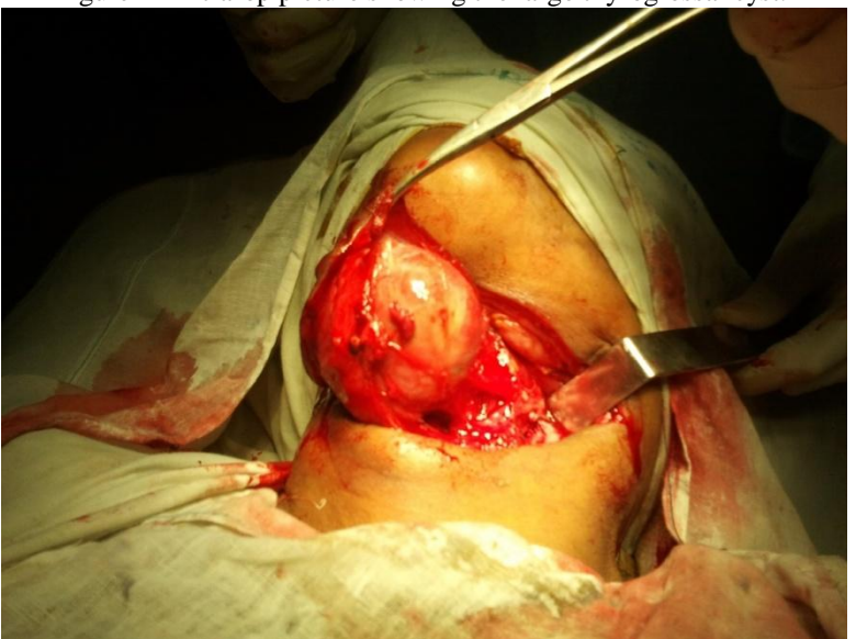
Figure 2 – Stalk attaching the cyst to the midpoint of hyoid bone

The patient was prepared for thyroidectomy.