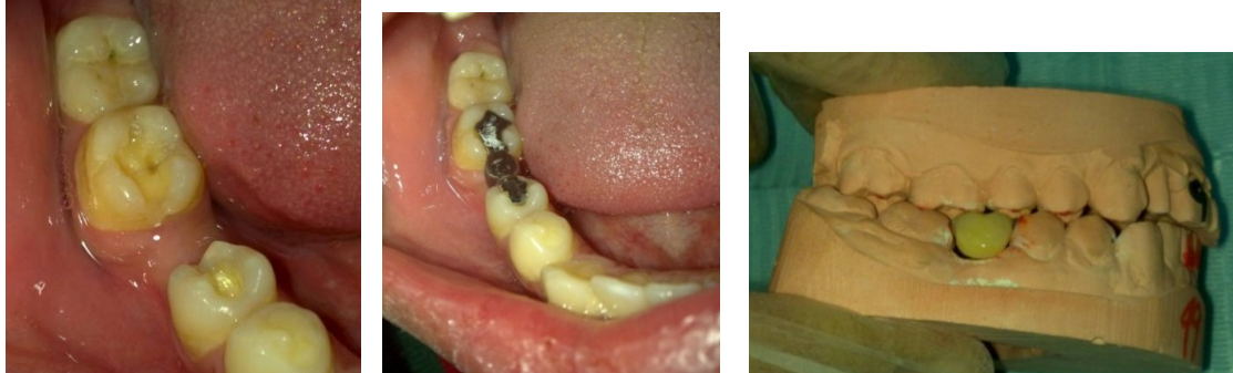
Figure-3: Inlay preparation on abutments Figure-4: Framework try-in