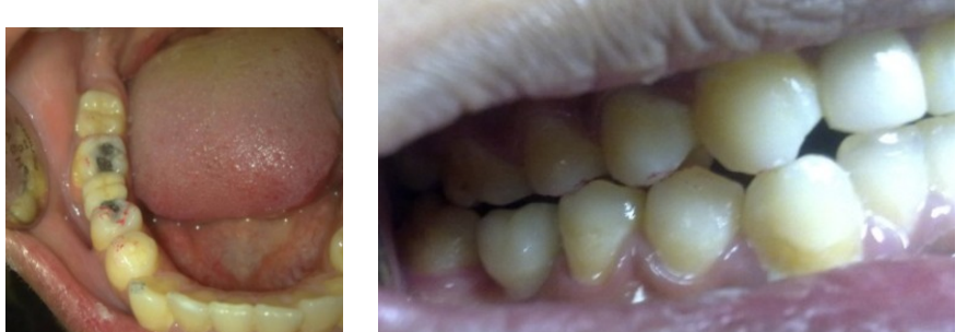
Figure-5: Intra oral occlusal adjustment during porcelain try-in Figure-7: After cementation and during lateral movement.