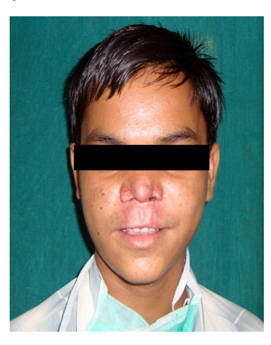
Figure III Patient Six months after AKT