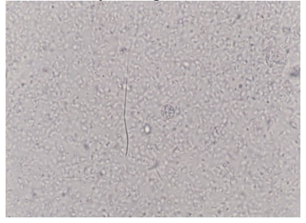
Figure 1: shows Cryptosporidium Oocyst Normal Saline mount (40X)

A total 113 stool samples were collected and stored at -20^{\circ} C without any preservative until used. The ELISA was used for Cryptosporidium antigen detection in stool samples. The samples were defrosted and enzyme immunoassay was performed as described by the manufacturer. The results were carried out spectrophotometrically through ELISA reader according to manufacturer guidelines.