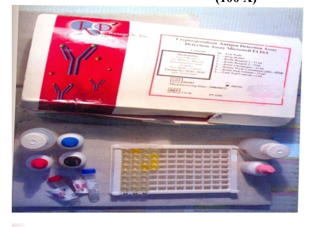
figure 3: Crytosporidium ELISA Kit