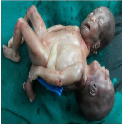
Fig 7. Conjoined twins (thoracoabdominopagus)