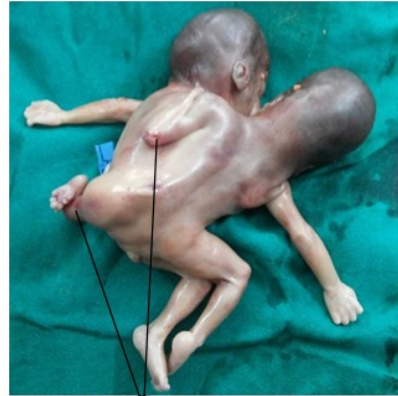
Fig 8 Rudimentary upper and lower limb

Intraoperative and postoperative period was uneventful.