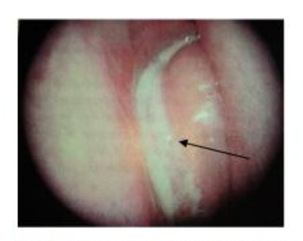
Fig-2: Mucopurulent discharge in middle meatus.

The mucosa is edematous, with obliteration of