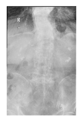
Figure 1 female patients, aged 78, leg pain, intermittent claudication, more than five years, preoperative lateral X-ray film showing lumbar degenerative disease, T12 (old, L2 (fresh) compression fractures, DEXA bone densitometer diagnosis of osteoporosis test