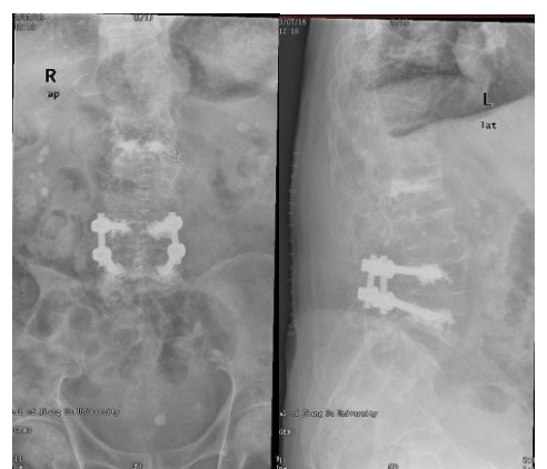
Figure 3 Postoperative lateral X-ray films, L4, 5 bone cement reinforced hollow side holes pedicle screw fixation is limited, good screw position, lumbar curvature of a good recovery, and no loose, pull out