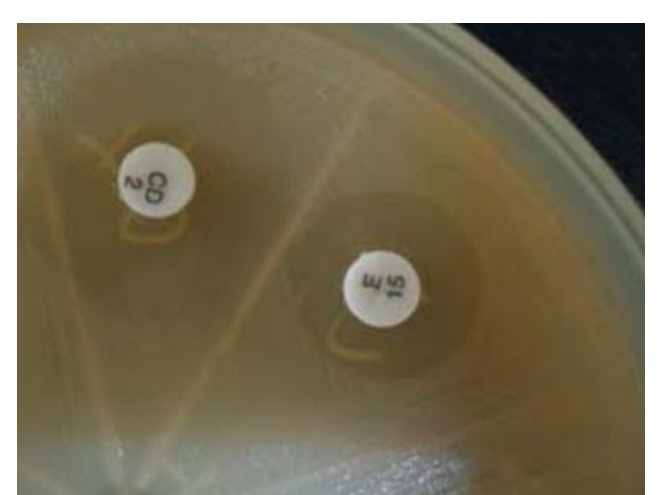
(Figure-4) Sensitive isolate. E-erythromycin 15 µg disc; CL-clindamycin 2 µg disc