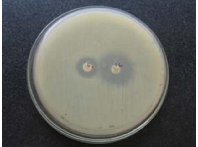
(Figure-2) D test negative isolate, resistant to erythromycin and sensitive to clindamycin

D Negative (MSB Phenotype): No flattening of the CL zone; Resistant to ER but susceptible to CL.(Fig.2)