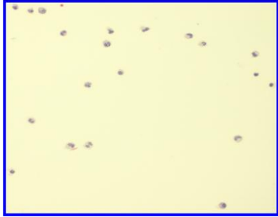
Figure 3: CSF pleocytosis (pap X 100)