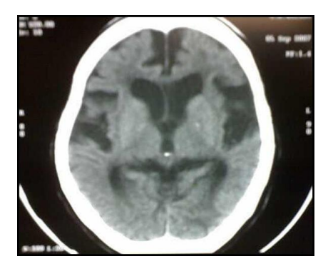
Figure 2: plain CT brain is unremarkable