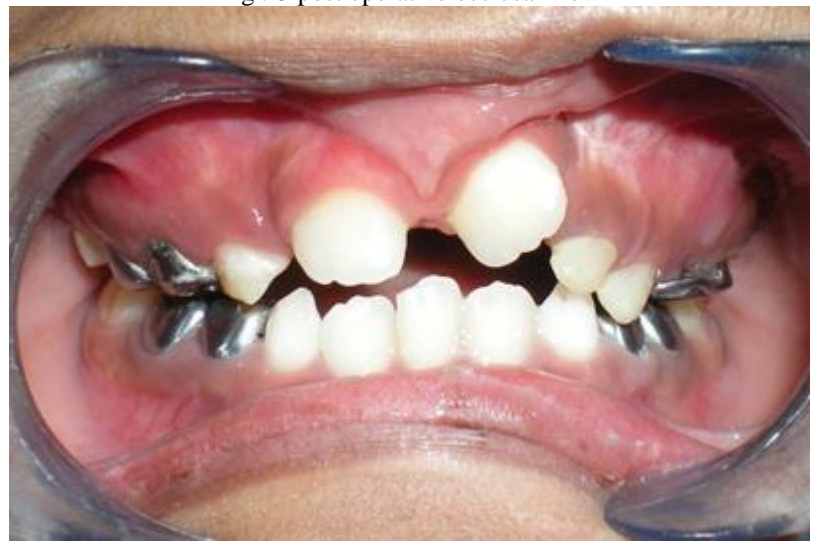
Fig:-6 post operative maxillary arch