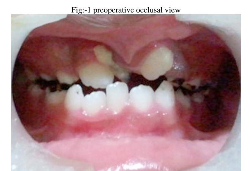
Fig:-2 preoperative maxillary arch