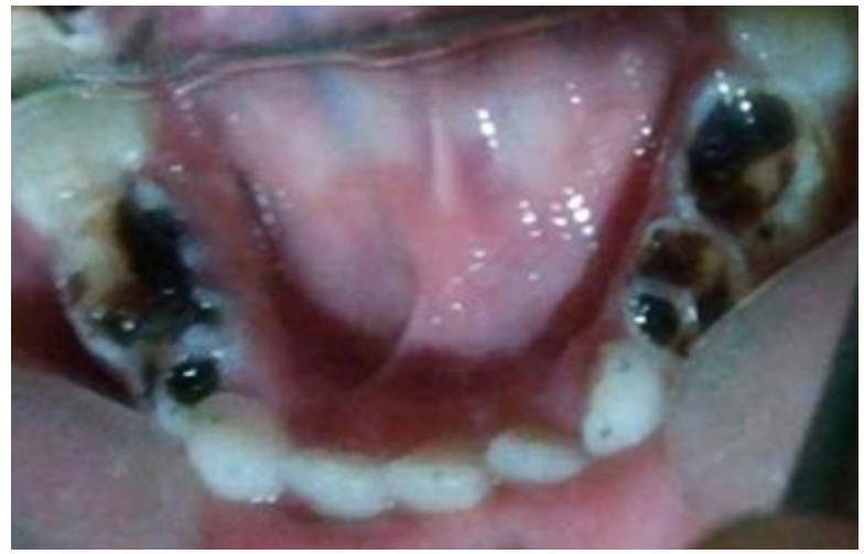
Fig :-4 preoperative OPG