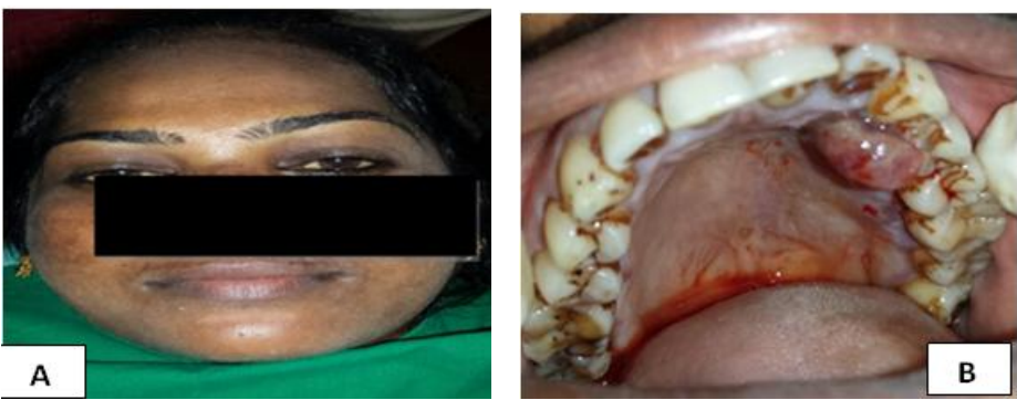
Fig. A and B: Pre-operative photo of the lesion in relation to 22 & 23