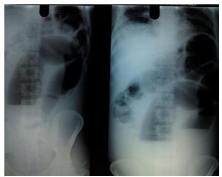
Figure 1 Erect abdomen X-ray showing distended loops of large bowel aggregated in left hypochondrium with some of the loops showing a coffee been appearance

After resuscitation under general anaesthesia abdomen was opened by midline incision. Huge dilated bluish black sigmoid colon was protruding out through the incision (fig.2). Twisted sigmoid was delivered out of abdomen and it was untwisted. Sigmoid colon was having narrow mesocolon and twisted on its narrow mesentery. Sigmoid was still bluish black in colour with thrombosed non pulsating vessels (fig.3). Sigmoidectomy was done (Hartmann's operation) with proximal end colostomy, primary end to end anastomosis was differed since sigmoid was gangrenous.