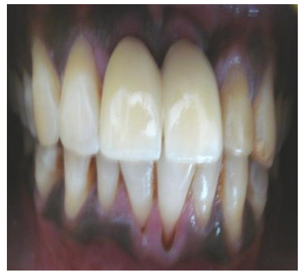
Fig. 14 final prosthesis in patient mouth