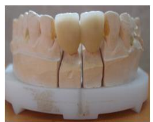
Fig. 13 fabricated Prosthesis