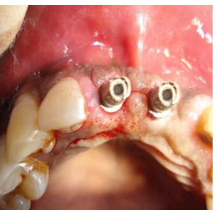
Fig. 11 Post operative radiograph after 5 months