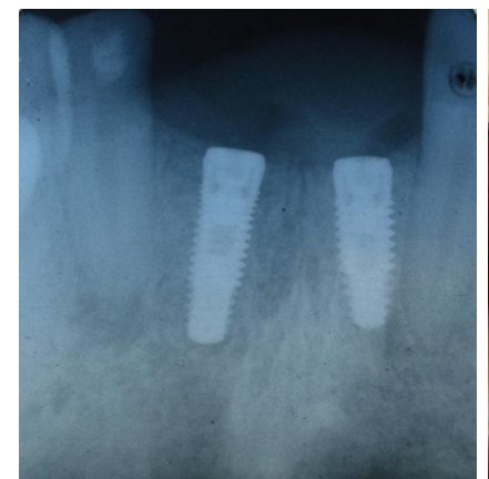
Fig. 10 operative site sutured with Interrupted sutures