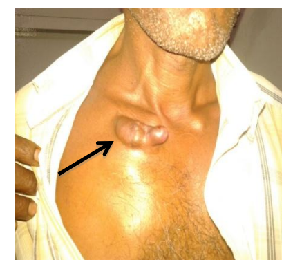
Figure 1 -Lobulated mass below the right clavicle.

A 55year old male presented with a swelling over the right medial infra clavicular region since 30years which gradually progressed to a size of 6X5 cm. On examination the swelling was horizontally oval in shape, soft, cystic and fluctuant with mild tenderness. It was reddish pink in color. The surface of the swelling was smooth but lobulated (fig, 1). It was diagnosed as a dermal lesion since skin was not pinchable and helplessly it was diagnosed as infected sebaceous cyst since we were not able to consider any other specific diagnosis.