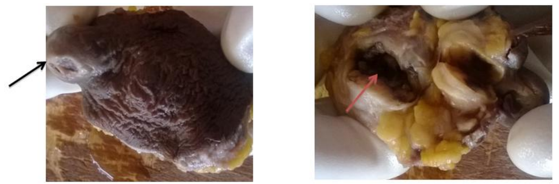
Figure 3A- Gross specimen.Figure 3B- Cut section showing cavity

Gross specimen was gray brown tissue measuring 5X4X1cm in size with skin intact (Fig 3A). Small oval growth was seen over the outer aspect of tissue measuring 2X1.5X0.5 cm. Cut section was showing two small grayish brown nodules below the skin surface (Fig 3B).