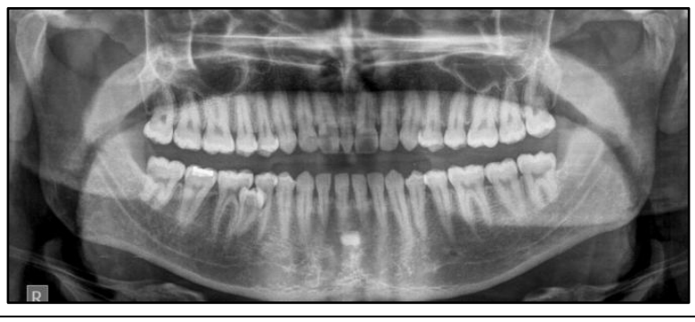
Fig. 6: OPG SHOWING MESIODENS & UNILATERAL SUPERNUMERARY MANDIBULAR PREMOLAR

FIG 5: LINGUALLY PLACED SUPERNUMERARY MANDIBULAR PREMOLAR ON RIGHT SIDE