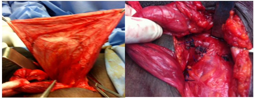
Hernial sac was separate and was medial to cord structures, which was extending medially upto pubic tubercle. After resection of excessive sac repair of the posterior wall done.