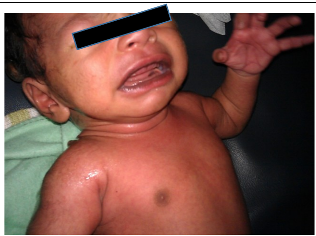
Figure 1: 4 week old neonate showing a neck swelling on right side and slight restriction of neck movement