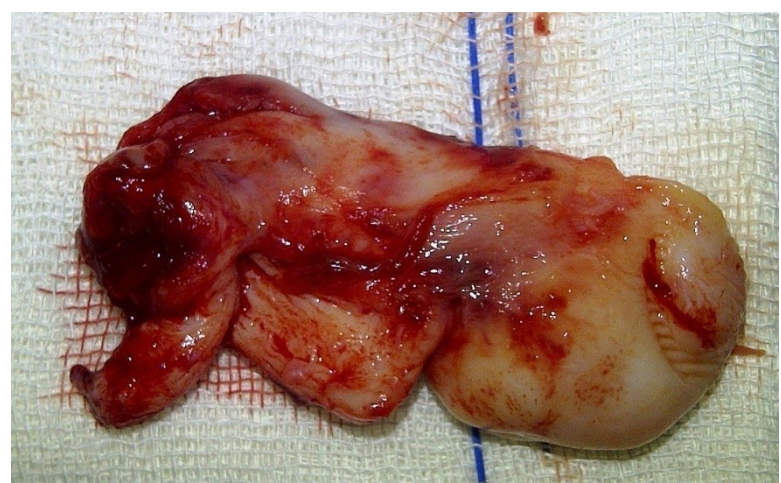
Figure 3: The mass after endoscopic removal of JAN