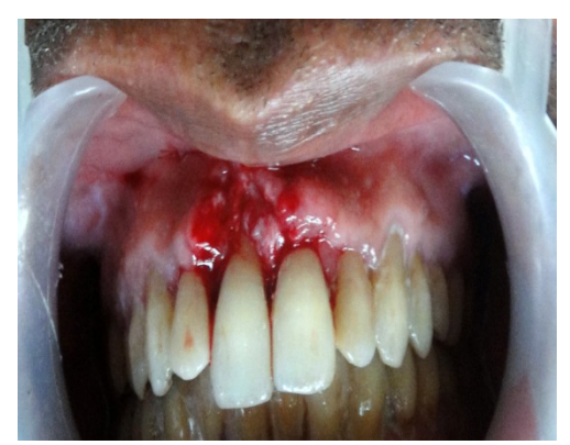
After sutures are removed