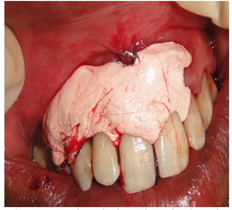
Sutures and periodontal pack placed