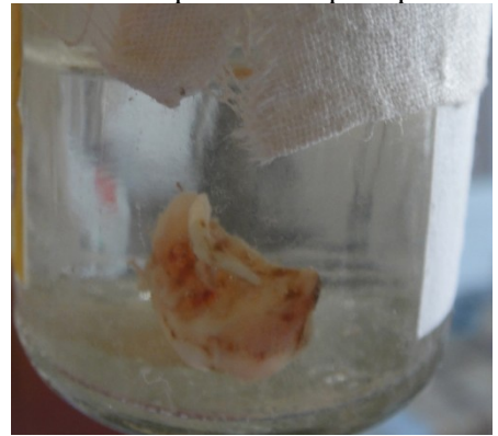
Sample sent for histopathological examination