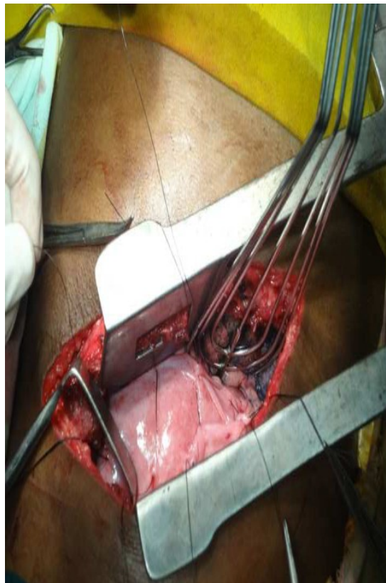
Figure 2: Thoracotomy wound showing placcation of diaphragm