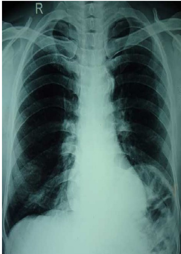
Figure 1: X-ray chest showing elevated left dome of diaphragm