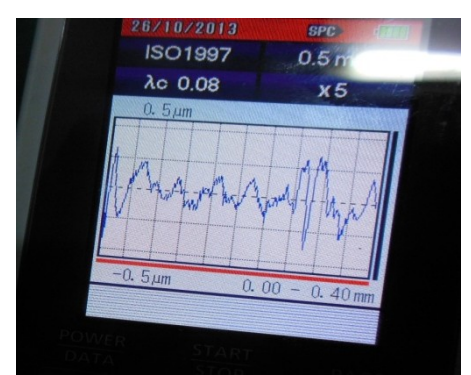
Fig 4:- Graph displaying the values.

Hardness Measurements :-Before & after the pH – cycling regime all specimens was analyzed using a Digital microhardness Tester in vickers hardness value