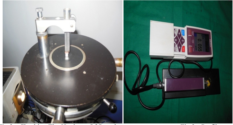
Fig 2:- Checking The Hardness Of Sample

An in vitro evaluation of pH variations on physical properties of tooth coloured restorative materials.